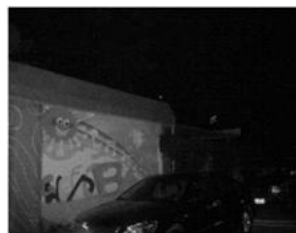
With Scene's IR