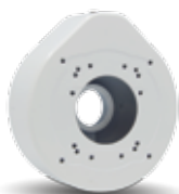
Junction Box (PR-B20JB) is available

Sensor: 1/3" Sony, 2 Mega-Pixel Selectable output-1080P AHD/Analog Lens: 2.8-12mm Mega-Pixel Vari-Focal True Day & Night – ICR IR Range: 40m (4 Array LED) IP66 Weight: 836g Power: DC 12V, ~480mA