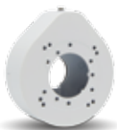
Junction Box (PR-B30JB) is available

Sensor: 1/3" Sony, 2 Mega-Pixel Selectable output-1080P AHD/Analog Lens: 3.6mm Mega-Pixel Fixed True Day & Night – ICR IR Range: 25m (3 Array LED) IP66 Weight: 380g Power: DC 12V, ~410mA